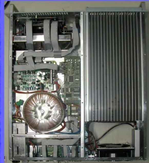
These photos shown the TEX500 with the telemetry option.